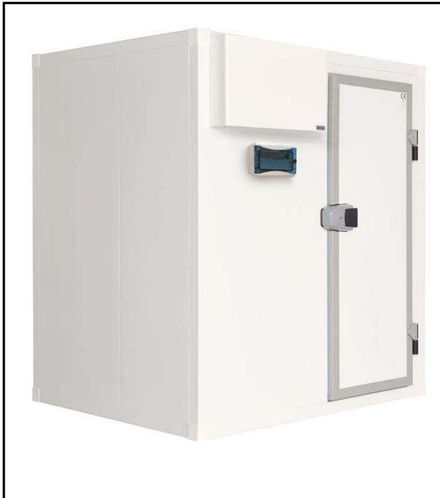
102098 (CRF2020SG13N) Cold/Freezer Room 2030x2030 th.100mm, split Unit